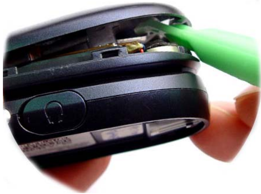
3 .Inside view of Samsung A920 - AccessoryGeeks.com