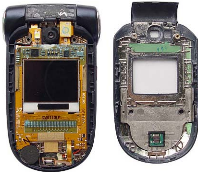
4. Remove the 2 screws with small phillips screw driver.