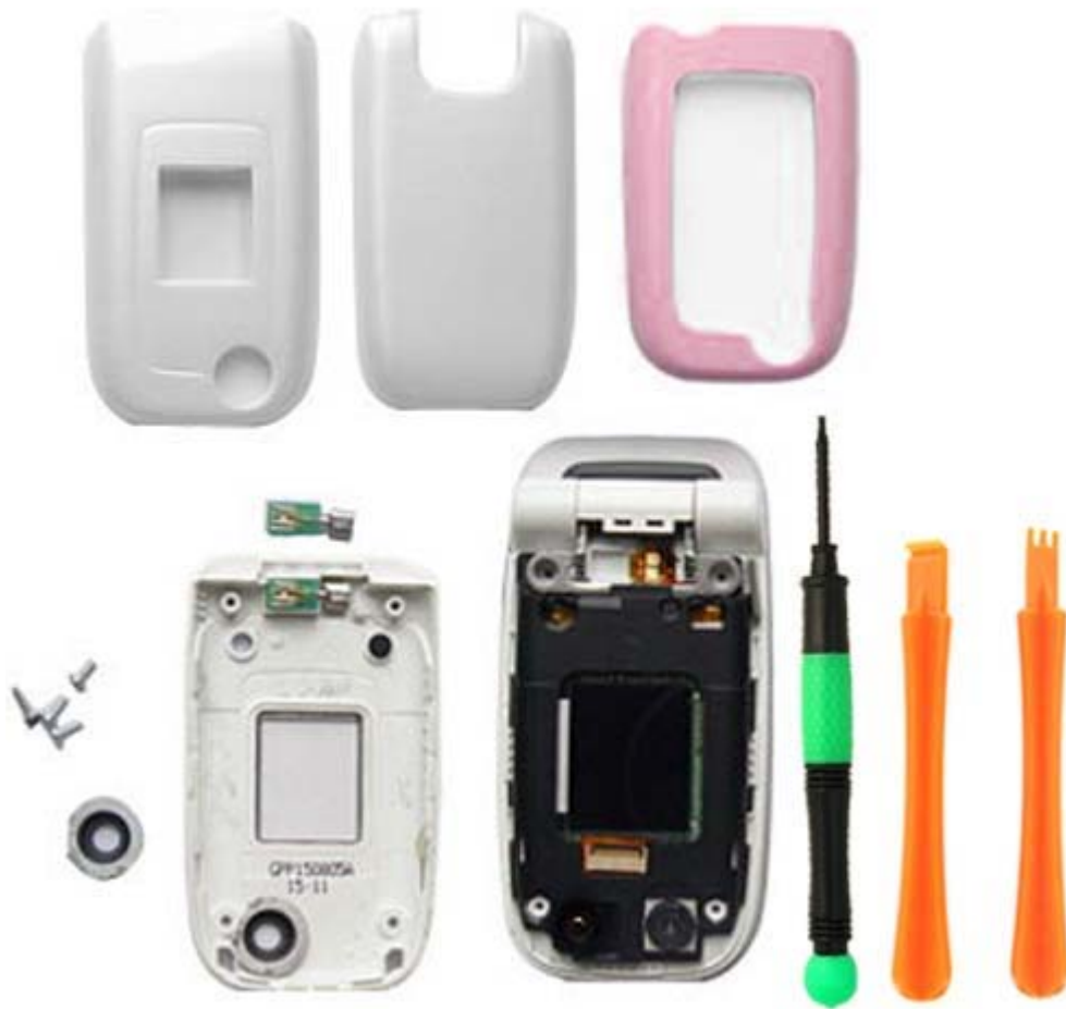
IMAGE OF WHEN EVERYTHING IS LAID OUT AND REMOVED FROM THE PHONE

Step 3: After the both faceplates are removed, next remove the little component and camera shield away from your old faceplate.